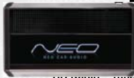
HD Radio Tuner