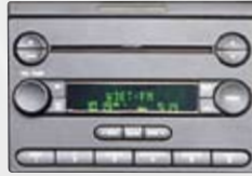
Factory Radio Not Included