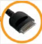
11Ft. iPod Cable