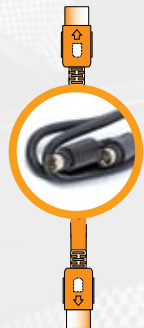
3Ft. HD Radio Cable