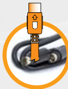
3ft. HD Radio Cable

HD Radio™ Tuner (sold separately) Part #: HDRT