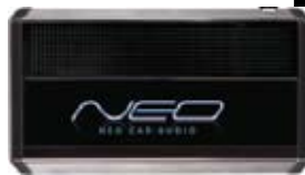
HD Radio™ Tuner