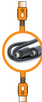
3Ft. HD Radio Cable (sold with HDRT)