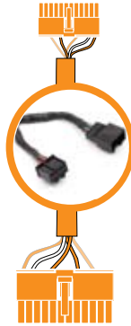
Neo Gateway Harness