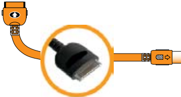
11Ft. iPod Cable