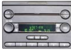
Factory Radio Not Included