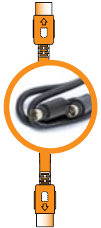
3Ft. HD Radio Cable (sold with HDRT)