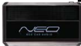
HD Radio™ Tuner