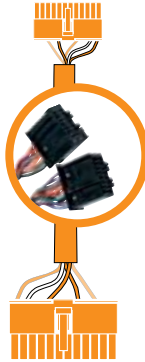
Neo Gateway Harness