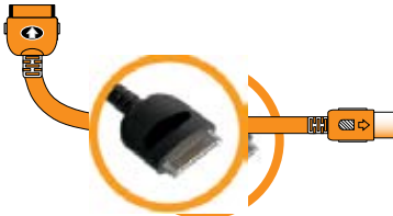
11Ft. iPod Cable