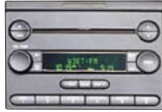
Factory Radio Not Included