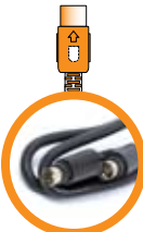
3Ft. HD Radio Cable