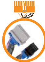
Neo Gateway Harness