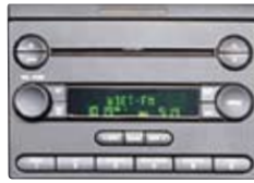
Factory Radio Not Included