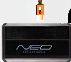
HD Radio™ Tuner