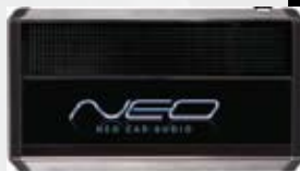
HD Radio™ Tuner