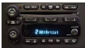
Factory Radio (not included)