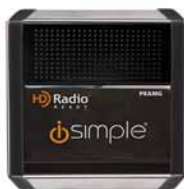
GateWay™ Interface (not included)